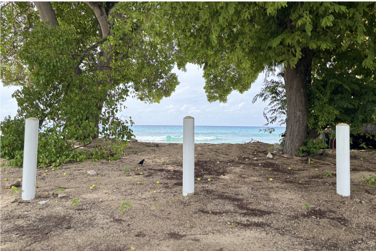
The installation of the 30 bollards aims to conserve the sea turtles population.

To date, over 20 turtle friendly lights have been installed as part of the project.