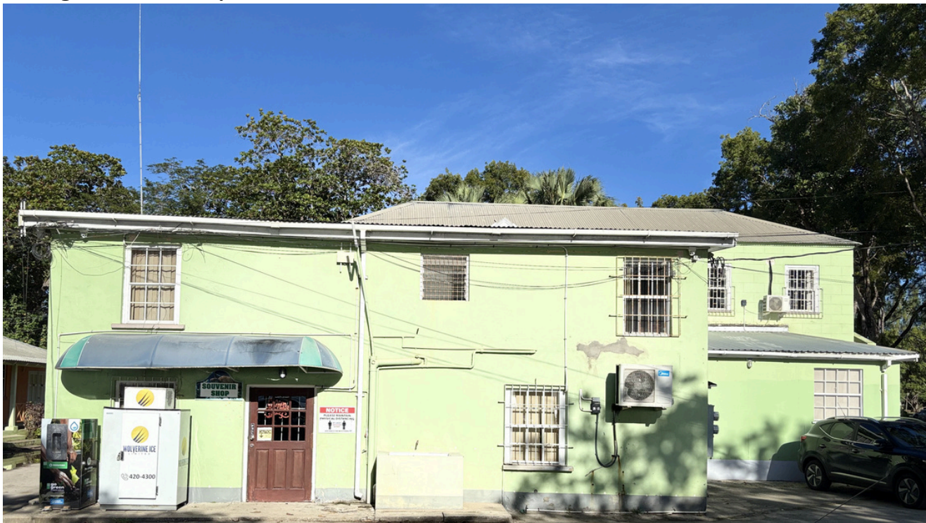
The installation of the electrical back-up storage units will commence in 2025.

Project updates will be provided in upcoming editions of The Commission , as the team endeavours to bolster the NCC’s daily operations, with the support of efficient electrical supply.