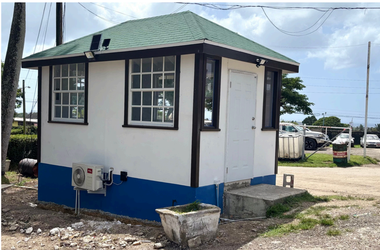
Solar powered emergency lights have been installed on the security station.

And despite the brief disruptions, the new security station was constructed, completed and presented to the Ranger/Warden service, within one month - the stipulated timeline.